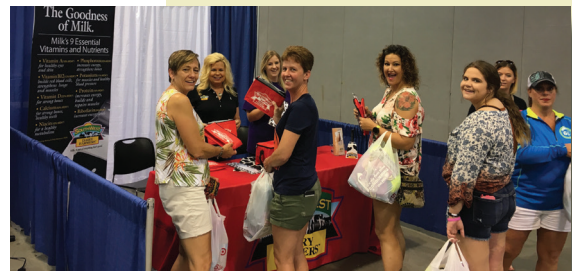
Above: The Health and Fitness Expo attendees excited to receive a cooler bag and hear about chocolate milk as their post work out drink.

Southwest Dairy Farmers attended the 44th annual Hospital Hill Run in conjunction with The Health and Fitness Expo in Kansas City, Missouri on June 1-3, 2017. Over 15,000 people came through the expo which provided SWDF an excellent opportunity to promote chocolate milk as the best sports recovery drink. Chocolate milk contains high-quality proteins that help restore and rebuild muscles after vigorous exercise like running a marathon. The Hospital Hill Run is the oldest race in Kansas City and one of the oldest half marathons in the country. It is also touted as one of the top 25 road races in the United States. The challenging and hilly Hospital Hill Run offers runners a choice of running a half-marathon, a 10K or a 5K. After the race, runners rehydrated with chocolate milk and enjoyed an ice cream sandwich as a cool treat. This provided a great venue to highlight all the important aspects that chocolate milk offers to runners.