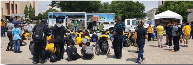
Above: Crowds gathering during a milking demonstration at Earth Day Texas.

Again this year, Southwest Dairy Farmers attended one of the world's largest Earth Day celebrations in Dallas, TX on April 21-23, 2017. Earth Day Texas is the world's largest annual forum for sharing the latest initiatives, discoveries, research, innovations, policies and corporate practices that are reshaping our world. Southwest Dairy Farmers were on hand with live milking demonstrations and promotional item giveaways during this three-day event. This was a great opportunity for SWDF to share our message to thousands of people about the importance of dairy and how our dairy farmers are stewards of land and the environment.